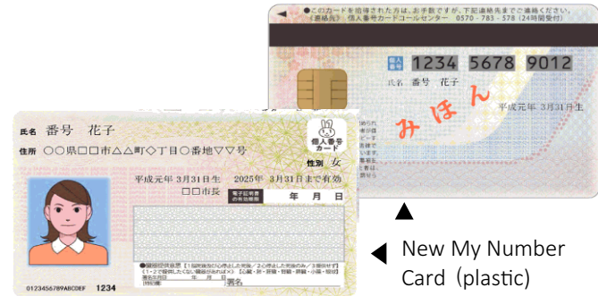
New My Number Card (plastic)

Once you have received a Delivery Notice (postcard), please bring the notice and a piece of ID to the City Hall for pickup. For children