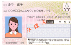
▲ My Number Card

Getting these certificates from the convenience store may save you both time and money! It costs ¥100 less to get certificate of residence (copy), inkan, income tax, and supplementary family register at convenience stores than at the city office.