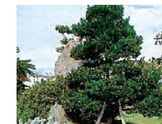
Ryukyu ebony (official tree)

“Netate” is the Japanese words that means “the root of things,” such as the root of a community or a festival. Ginowan City is often referred to as the root (“ne,” “nenoshima,” “netate”) of Ryukyu that had been vital in the island’s political, economic and cultural development. The city was an important centre of trade and information exchange with neighboring countries. Today, Ginowan continues to grow as a modern netate where people, goods and information flow in and out on an international level. “Netate no Machi Ginowan” is the watchword of the citizens of Ginowan that symbolizes the city’s endless potential.