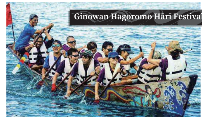
Ginowan Hagoromo Hārī Festival