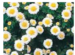
Chrysanthemum (official flower)

A long-lasting subtropical flowering plant with vibrant colors. Adopted on December 9, 1975.