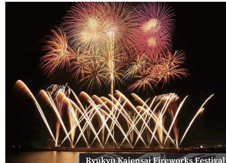
Ryukyu Kaiensai Fireworks Festival