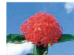
Sandanka (official flowering plant)

Traditionally used to make the sao (neck) of the sanshin (a traditional Okinawan three-stringed instrument). Adopted on January 11, 1996.