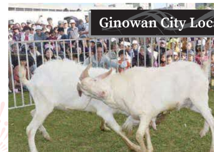
Ginowan City Local Industries Festival

To promote Ginowan's industries through the exhibition and sale of produce, seafood, livestock, and commercial and industrial products. Local Industries Festival Executive Committee ☎ 098-893-4411