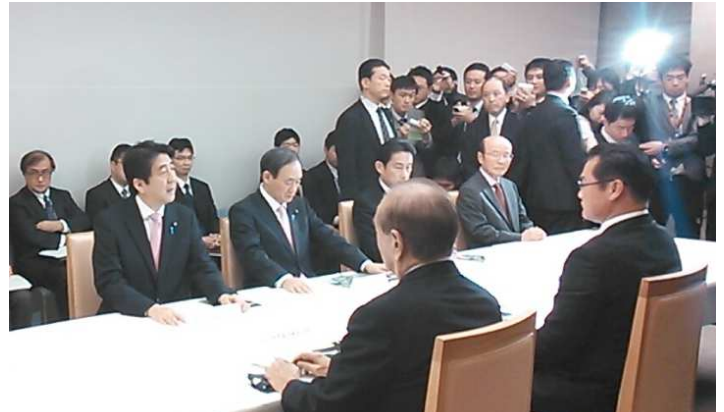
↑ Council for Promoting and Alleviation of the Burden of Futenma Air Station

In February 2014, Ginowan City requested for the Government of Japan to come together for a conference to discuss “the permanent closure of MCAS Futenma within the next 5 years.” On February 18, officials led by Prime Minister Abe conducted the Council for Promoting the Alleviation of the Burden of Futenma Air Station Meeting. 3 other promotional meetings and 5 additional meetings involving the task force followed. In the meeting, the “the permanent closure of MCAS Futenma within the next 5 years” and the mitigation of current adversities deriving from the base was discussed.