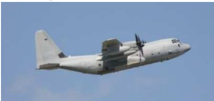
↑ KC-130 Aerial Refueling Craft

As a part of the effort to alleviate the burden of MCAS Futenma on Okinawa, 15 KC-130 Aerial Refueling Crafts were relocated to operate out of Iwakuni Air Station in August 2014.