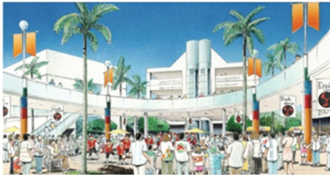
↑ A new social hub for local residents