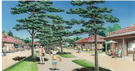
↑ A row of Pine Trees to replicate the historical "Nan-machi"