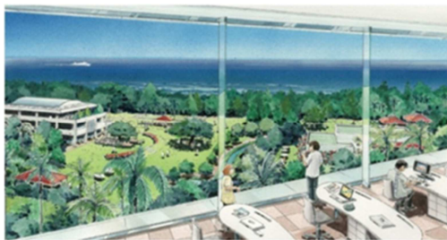
↑ Okinawa Promotion center incorporating the rich greenery and ocean-view