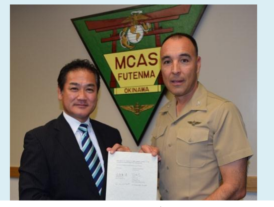
December 22<sup>nd</sup>, 2015 Mayor of Ginowan City, MCAS Commander

Emergency Vehicle Access Agreement with MCAS Futenma.