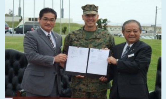
November 5<sup>th</sup>, 2012 Mayor of Ginowan city, Pacific Commander, Mayor of Chatan Town

As a result of the Disaster Response Evacuation Agreement there has been some confusion among the ordinary local citizens. If they can pass through the base in the event of an evacuation. After that, the citizens who have entered the base and confirmed the evacuation route will continue to carry out the related training.