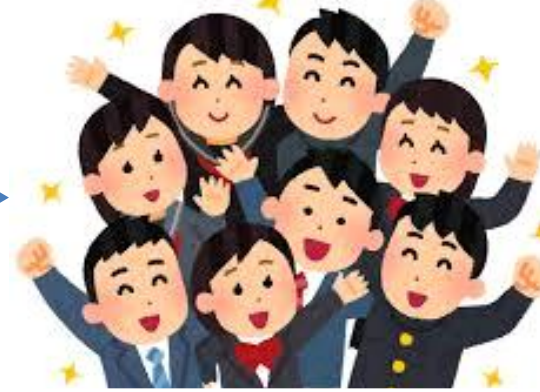
Local Junior High School Students

The project to give the middle school students the opportunity to study abroad equally without economic burden