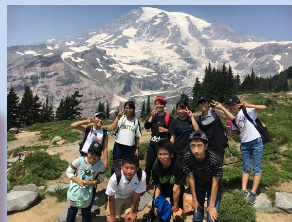
2018 Report of Study Abroad

We stayed in Washington D.C for 4 days. So we went Japanese Embassy, state Department, pentagon, Lincoln Memorial and the white House. The white house appearance was pure white. But, the inside was colorful. At the Japanese Embassy and the state Department, for us it was difficult story, but I was able to learn about the relationship between America and Japan I was able to learn a lot.